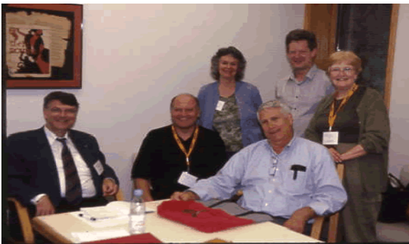
Some IVS Board members take a short break in their meeting.